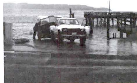
The City will be preparing plans to improve the Redondo boat ramp. Public input is encouraged.

Suggestions on how to improve the ramp's compatibility with the neighborhood include: