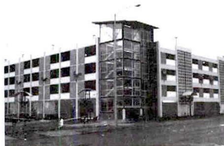
The Sounder garage provides free parking for commuter train riders. It is located at James Street and 1st Avenue North in Kent.

Sound Transit opened the Kent Station Garage in March, providing easy, free parking for Des Moines residents who would like to take the commuter train into Seattle. The first floor is available for commuter parking, with additional floors opening as the rest of the station facilities are completed and as customer demand for additional parking grows. The garage, located at James Street and 1st Avenue North next to the Sounder train station, will eventually provide 871 parking spaces for commuters traveling to and from Kent on Sounder commuter rail, ST Express regional buses and King County Metro buses.