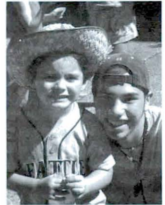
Lots of smiles at Camp K.H.A.O.S.

Don't just have an ordinary summer – have an OUTRAGEOUS summer at the City of Des Moines Park & Recreation Department's Camp KHAOS! Youth ages 5-11 will have tons of fun at our day camp that is full of exciting activities including arts and crafts, games, sports, outdoor activities, field trips, music, snacks, and much more, plus swimming every week! For more information, please call Des Moines Park & Recreation at 206-870-6527.